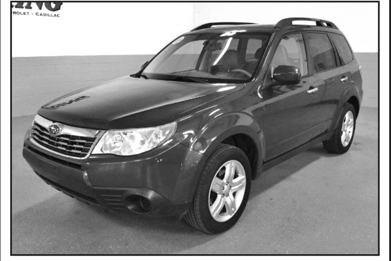
2010 SUBARU FORESTER 2.5X

CARFAX 1 owner!! Heated Seats, Alloy Wheels, NEW TIRES! Tow Pkg, CD player, Satellite Radio, Sunroof, Air, Cruise control, Power seats.