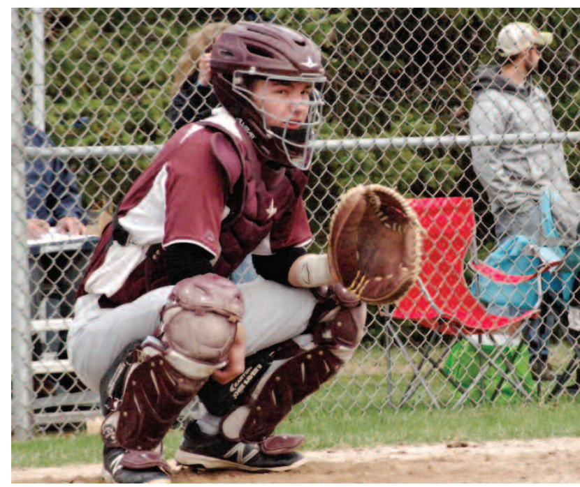
Charlevoix's catcher looks to the dugout to get the next sign that he will relay to the pitcher.